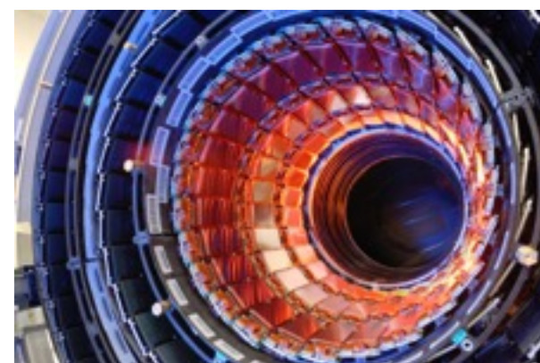
CMS Tracker Detector

Activity webpage: http://www.ncp.edu.pk/wtdhep-2015.php